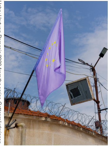
Hahn+Hartung, Romania 2022, from the series „Gattenmörderinnen: Geschichten vom Überleben“