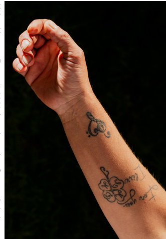
Hahn+Hartung, Romania 2022, from the series „Gattenmörderinnen: Geschichten vom Überleben“